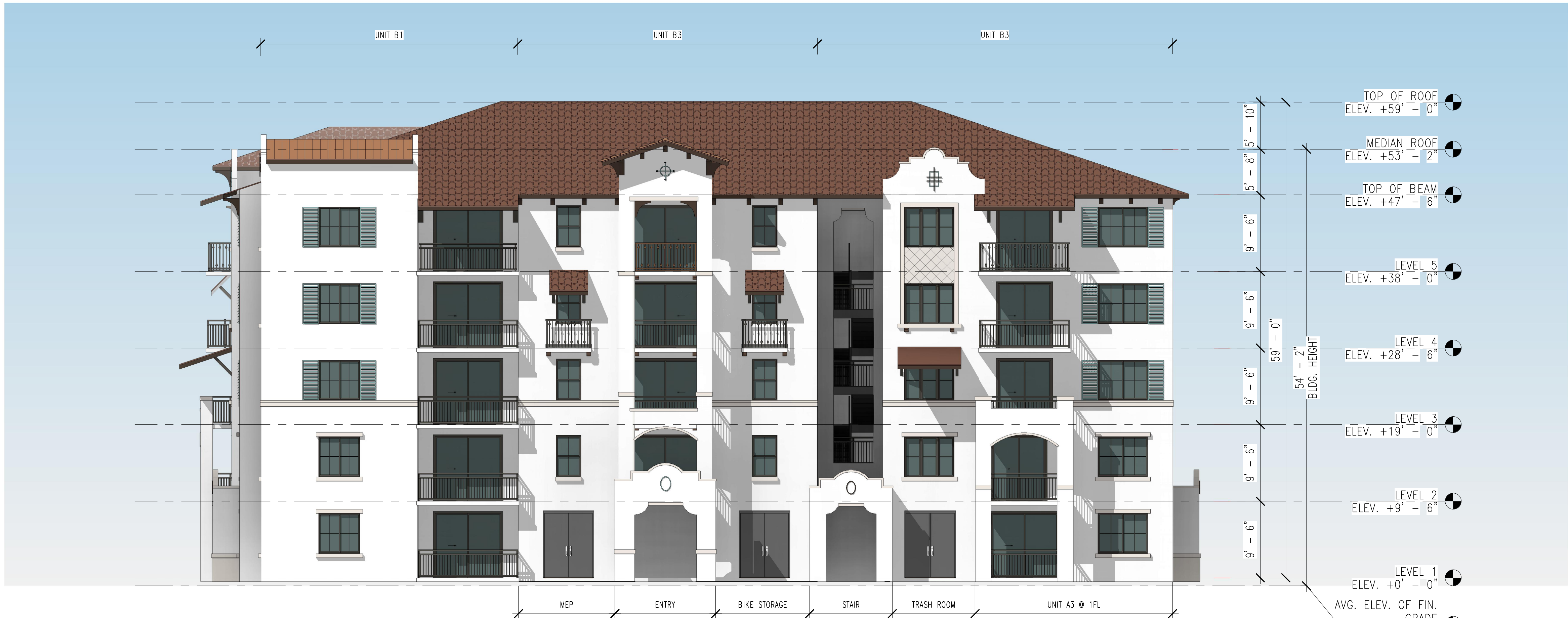
② SIDE ELEVATION 1/8" = 1'-0"