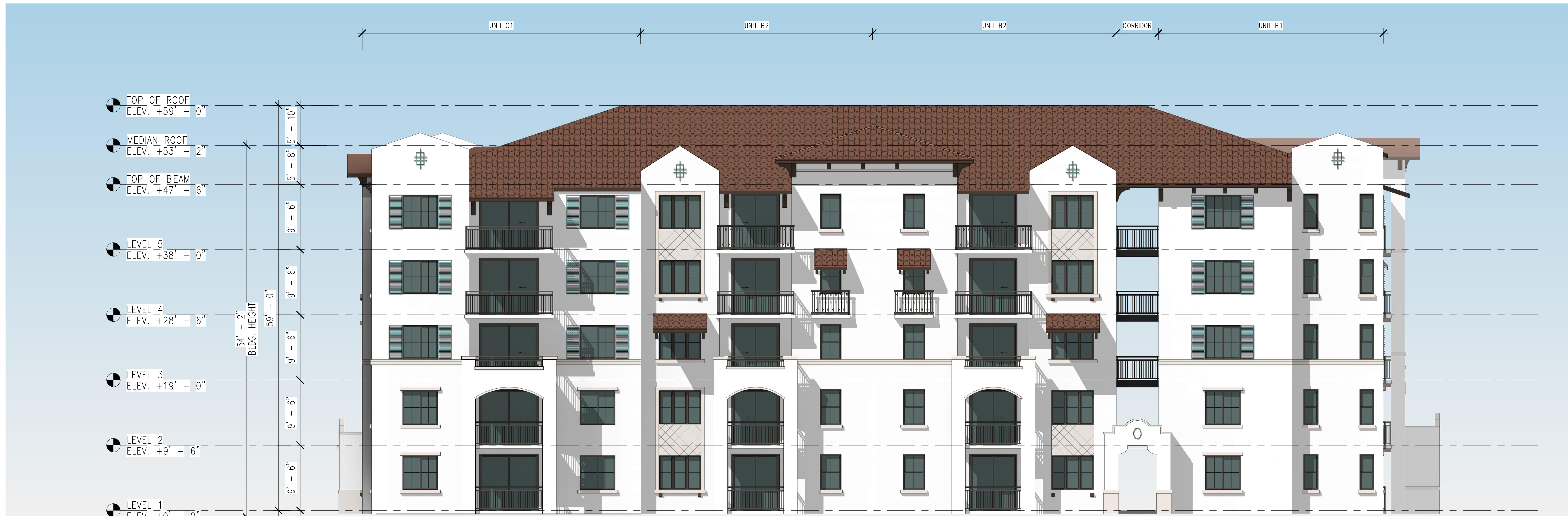
① FRONT ELEVATION 1/8" = 1'-0"